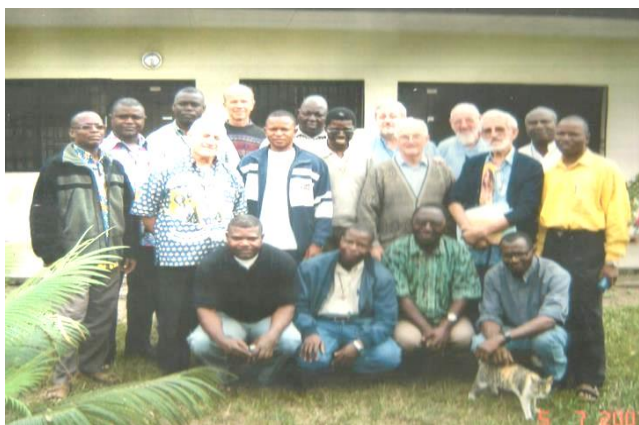
Photo of the 1 st Provincial Chapter

It became a Region on 26 September 1973, under the name of an autonomous Region of Zaire (RAZ), then this mission changed its name in February 1996 when, from the first Provincial Chapter, it became Blessed Isidore Bakanja, a name that came into force in 1998.