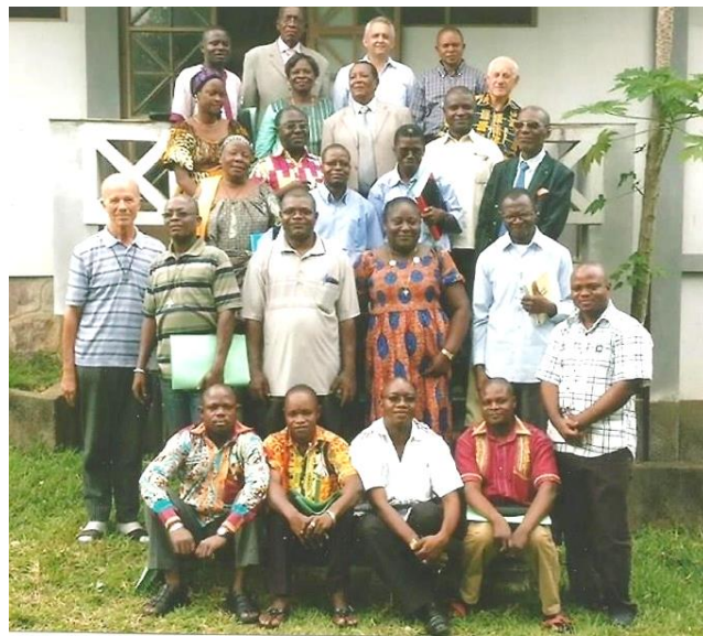
Photo of the 3 rd Provincial Chapter